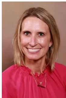
South Atlantic Director