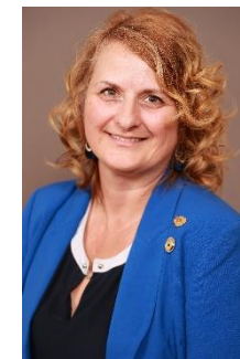
South Central Director