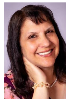
Pacific Southwest Director