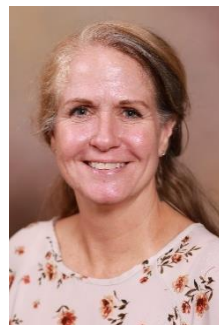
Pacific Northwest Director