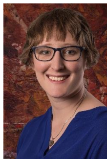
North Central Director